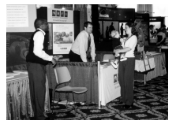
There was a great deal of interest in hearing what our vendor-partners had to offer.